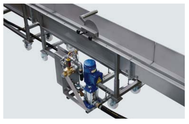
Cooling trough KW 160 with integrated process water system