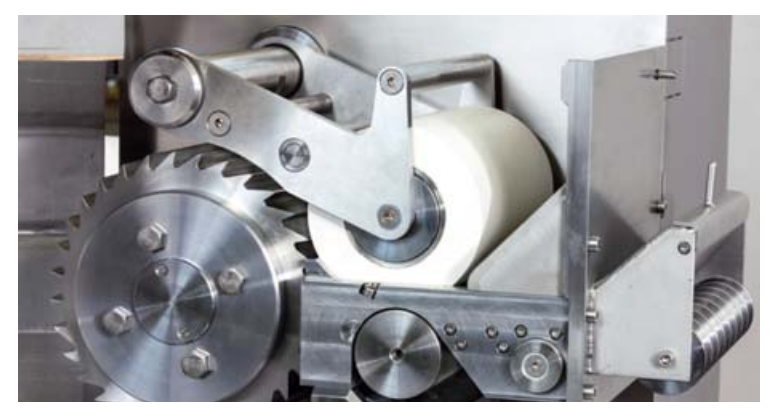
PRIMO 200 E with elastomer feed roll