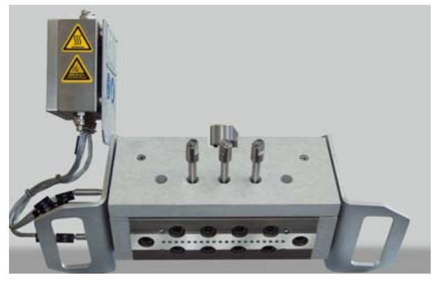
Die head SG200C