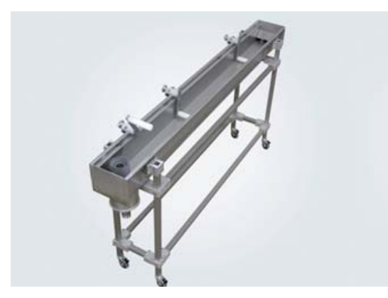
Cooling trough KW 160