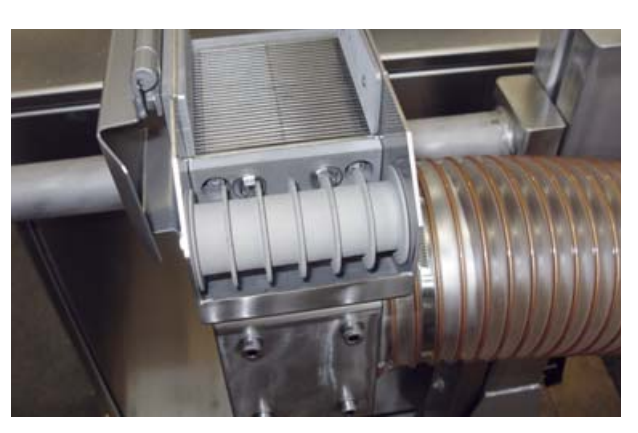
SE 100-2 air knife